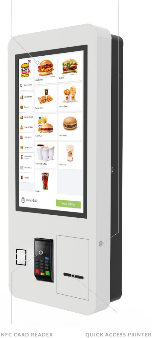
OPTIONAL NFC CARD READER